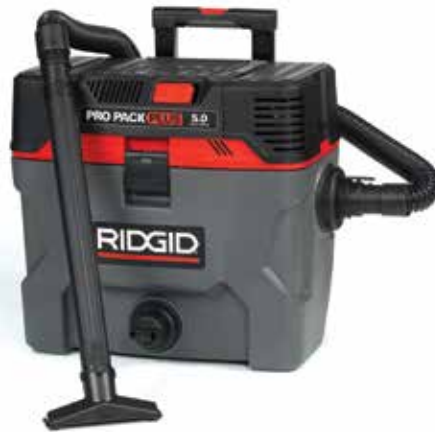
10 GALLON PROPAK® WET/DRY VAC (1000RV)