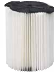
VF4000 EVERYDAY DIRT 1-LAYER PLEATED PAPER FILTER