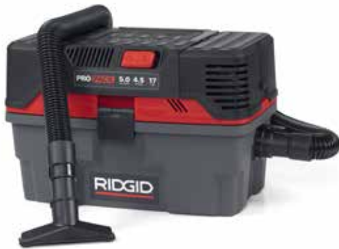
4.5 GALLON PROPAK® WET/DRY VAC (4500RV)