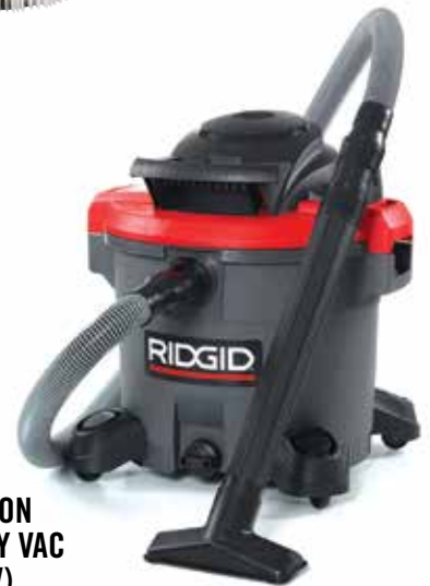
12 GALLON WET/DRY VAC (1200RV)