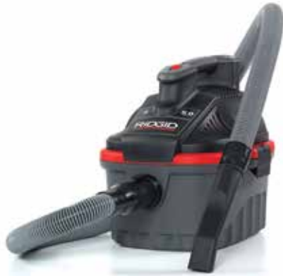
4 GALLON PORTABLE WET/DRY VAC (4000RV)