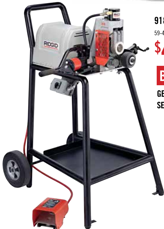
918 ROLL GROOVER