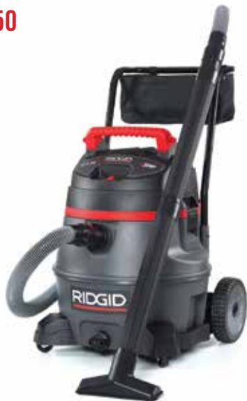
14 GALLON WET/DRY VAC WITH CART (1400RV)