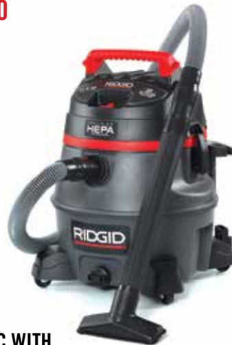
14 GALLON WET/DRY VAC WITH CERTIFIED HEPA FILTRATION (RV2400HF)