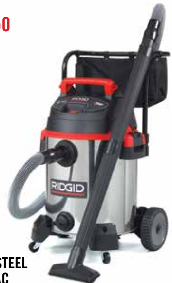
16 GALLON STAINLESS STEEL WET/DRY VAC WITH CART (1610RV)