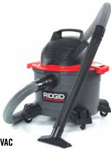
6 GALLON WET/DRY VAC (RV6000)