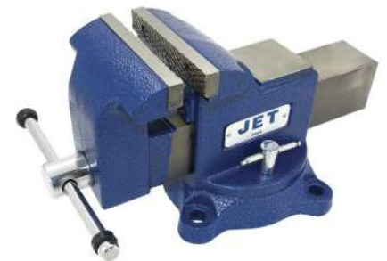
6" SWIVEL BASE VISE - HEAVY DUTY JET-320153 REG. $400 $221.00