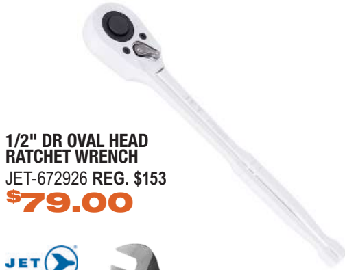
1/2" DR OVAL HEAD RATCHET WRENCH JET-672926 REG. $153 $79.00