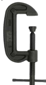
4" C-CLAMP - HEAVY DUTY JET-390104 REG. $75 $52.00