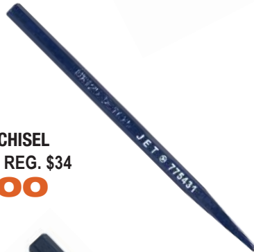
3/4" COLD CHISEL JET-775434 REG. $34 $20.00