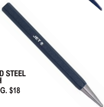
1/4" HARDENED STEEL CENTRE PUNCH JET-775443 REG. $18 $9.00