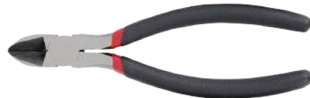
8" CUSHION GRIP DIAGONAL CUTTERS ITC-020628 REG. $17 $9.80