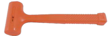
320Z DEAD BLOW HAMMER JET-740914 REG. $52 $24.00