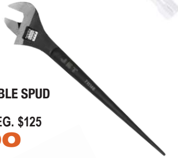
15" ADJUSTABLE SPUD WRENCH JET-711146 REG. $125 $70.00