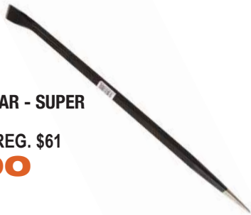
24" PINCH BAR - SUPER HEAVY DUTY JET-779212 REG. $61 $31.00