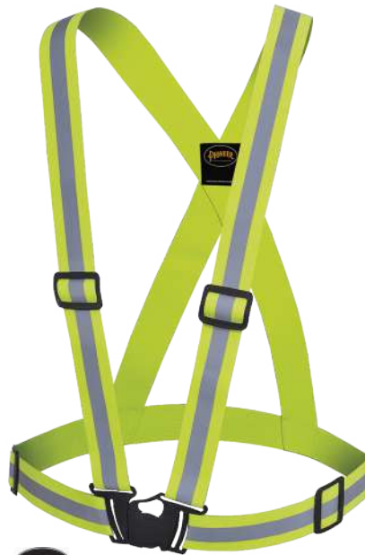
PIONEER HI-VIZ YELLOW/GREEN SAFETY SASH - O/S PIO-V1041060-O/S $12.00