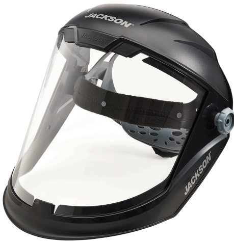
JACKSON MAXVIEW™ PREMIUM FACE SHIELD JET-14200 $28.00