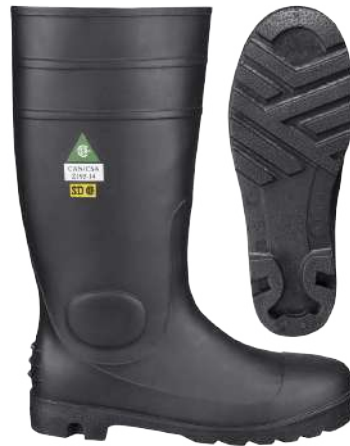
PIONEER BLACK PVC STEEL TOE/ PLATE BOOT PIO-V4710270 Sizes: 7-13 $49.00