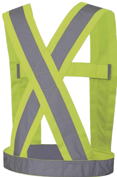
PIONEER HI-VIZ YELLOW/GREEN CSA 4" WIDE ADJUSTABLE SAFETY SASH - O/S PIO-V1040360-O/S $15.20