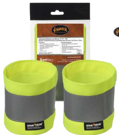
STARTECH HI-VIZ YELLOW/GREEN ADJUSTABLE REFLECTIVE ARM BANDS 14" X 4" - PAIR - O/S PIO-V1040161-O/S $9.36